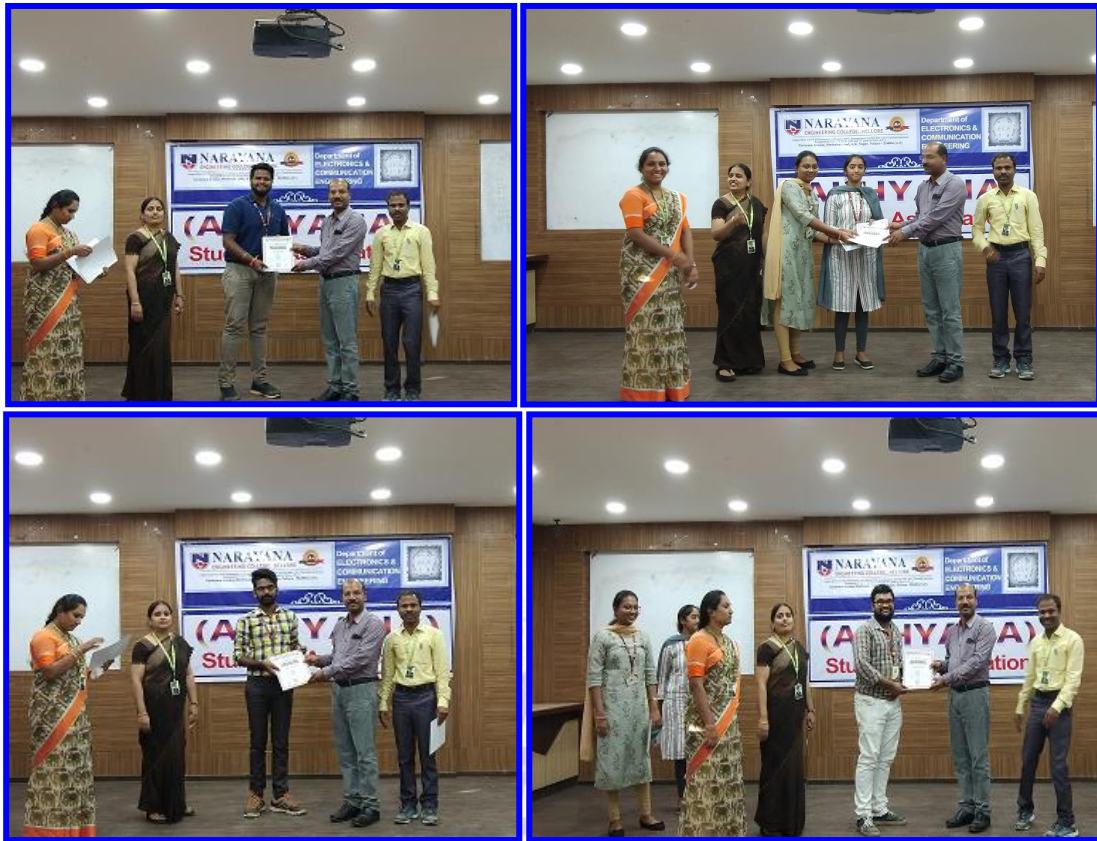
Fig: Certificate distribution to winners by HOD.

The questions put forth to the teams were intriguing, exciting and made the audience go 'Aah!' and clap when the teams answered correctly. Although the teams participated actively, the team that scored the most was Section-B Boys , It was very informative and knowledge enriching competition for the participants along with the audience.