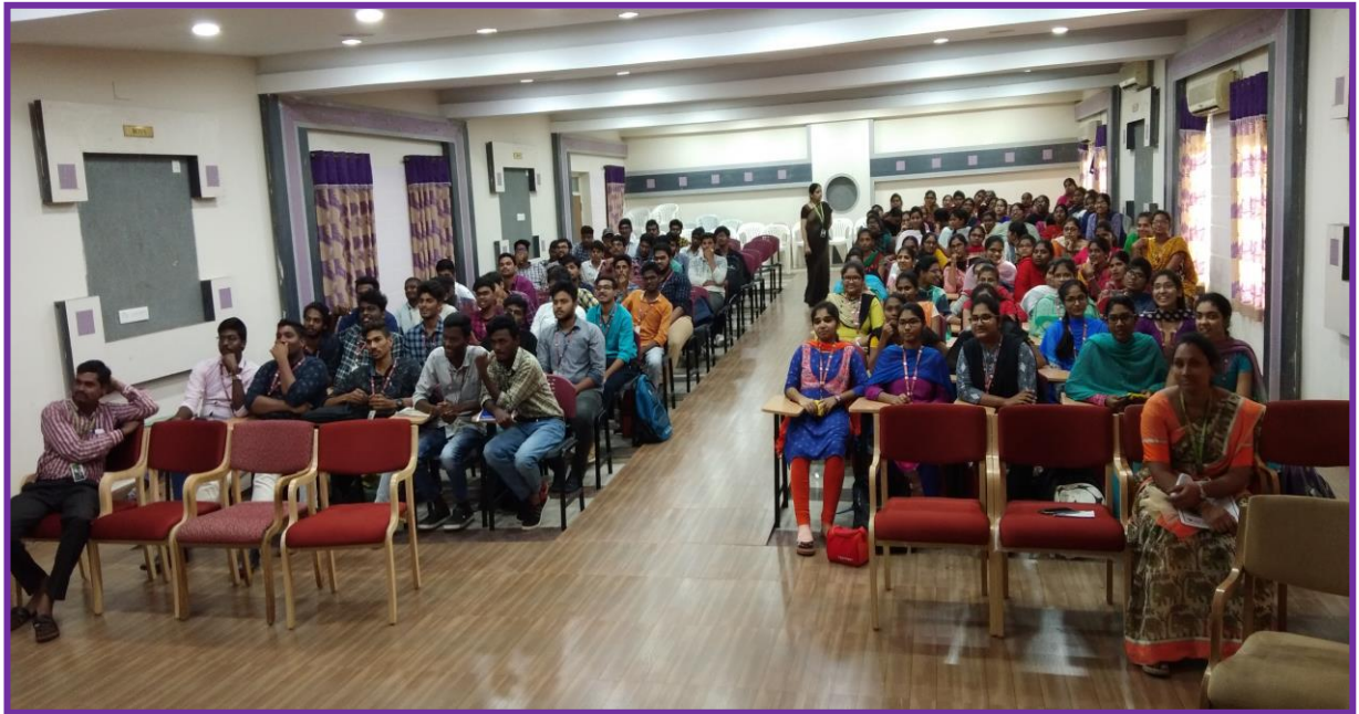
Fig: III B.Tech participating in an event.